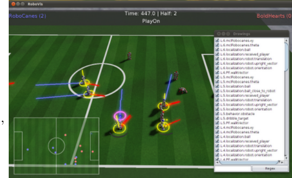
Fig. 1. RoboViz interface with debugging information and 2D bird view

Features include visualization and debugging (e.g., realtime debugging; direct communication with agents; selecting shapes to be rendered), interactivity and control (e.g., reposition of objects; switching game-play modes), enhanced graphics (e.g. stereoscopic 3D graphics on systems with support for quad-buffered OpenGL; effects such as soft shadows and bloom post-processing provide a visually enticing expe-